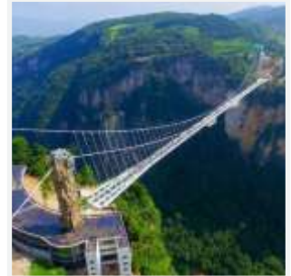
RAJGIR GLASS BRIDGE