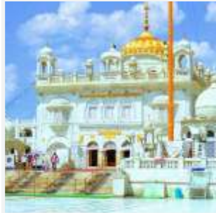
PATNA SAHIB GURUDWARA